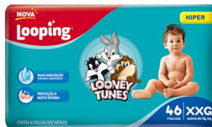
FRALDA LOOPING LT HIPER 46UN XXG 8406