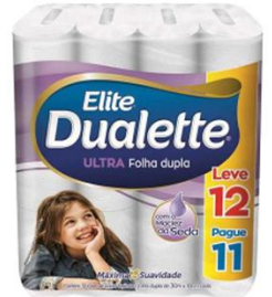
PAPEL HIG ELITE FD 30M L12P11 2447