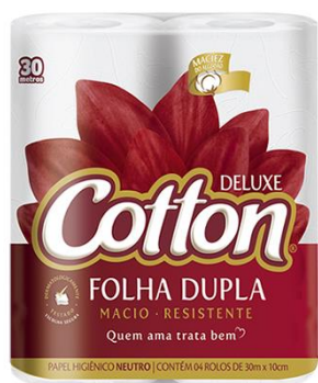
PH COTTON FD 30M NEUTRO 04UN 4436