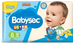
FR BABYSEC ULTRA MEGA G 38 UN 2449