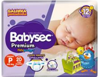
FR BABYSEC PREMIUM JUMBINHO P 20UN 2462