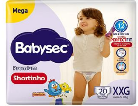
FRALDA BABYSEC SHORTINHO MEGA XXG 20UN 8161