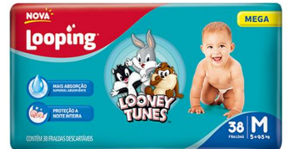
FRALDA LOOPING LT MEGA 38UN M 8417