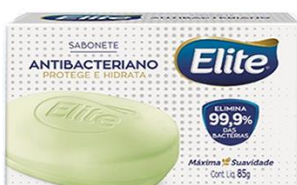
SABONETE BARRA ELITE ANTIBAC 85GR 1820