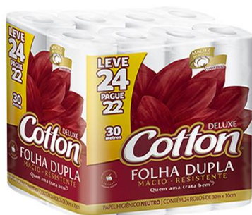
PH COTTON NEUTRO FD L24P22 8400