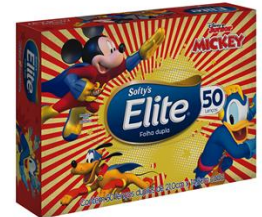
LENÇO SOFTY'S ELITE FD CX 50UN - KIDS 2461