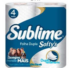
PAPEL HIG SUBLIME FD 30M 4UN 2443