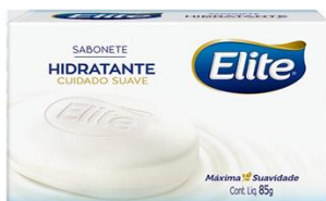
SABONETE BARRA ELITE HIDRAT 85GR 1819