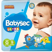
FR BABYSEC ULTRA JUMBINHO G 8X16 2405