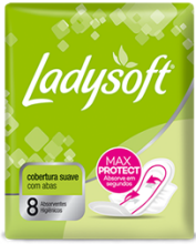
AB LADYSOFT NORMAL SUAVE C/A PCT 8UN 2409