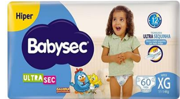
FRALDA BABYSEC ULTRA HIPER XG 60UN 8453