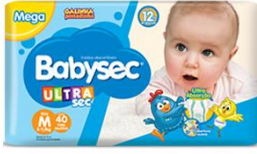
FR BABYSEC ULTRA MEGA M 44 UN 2448