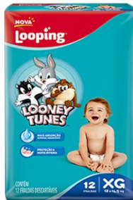
FRALDA LOOPING LT JUMBINHO 12UN XG 8409