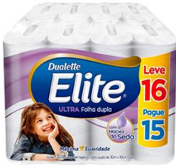
PAPEL HIG ELITE FD 30M L16P15 2441