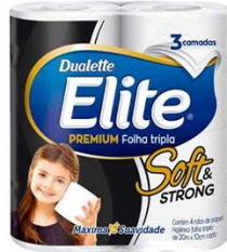
PAPEL HIG ELITE FT 20M 04UN 2445