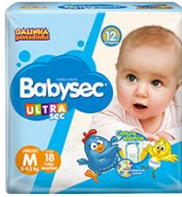
FR BABYSEC ULTRA JUMBINHO M 8X18 2408