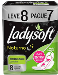
ABSORVENTE LADYSOFT NOT C/A L8P7 2411