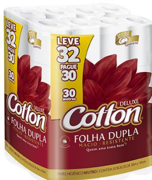
PH COTTON NEUTRO FD L32P30 8399