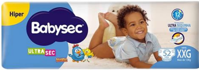
FRALDA BABYSEC ULTRA HIPER XXG 52UN 8454