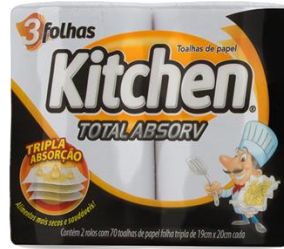
TOALHA DE PAP KITCHEN EVO FT 120F 2X60 1902