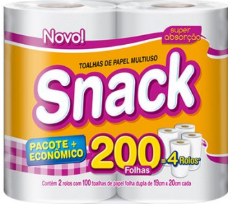
TOALHA DE PAPEL SNACK 02X50UN 2428