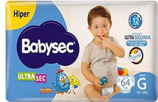
FRALDA BABYSEC PREMIUM MEGA M 32UN 8452