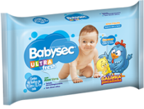
TOALHA UMED BABYSEC ULTRAFRESH PCT 46UN 2451