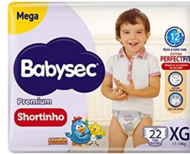
FRALDA BABYSEC SHORTINHO MEGA XG 22UN 8160