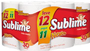
PAPEL HIG SUBLIME FS 30M L12P11 2436