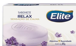
SABONETE BARRA ELITE RELAX 85GR 1821