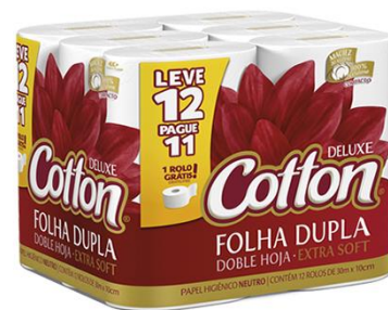
PH COTTON FD COMPACT 30M NEUTRO L12P11 4437