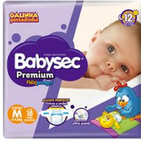
FR BABYSEC PREMIUM JUMBINHO M 18UN 2463