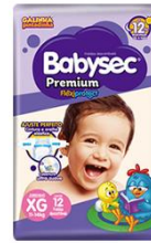
FR BABYSEC PREMIUM JUMBINHO XG 12UN 2465