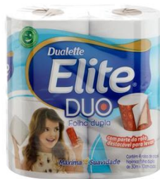
PAPEL HIG ELITE FD 30M 2444