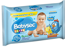
TOALHA UMED BABYSEC ULTRA FR GAL P 92UN 1677