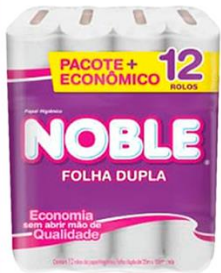
PAPEL HIG NOBLE FD 20M 1443