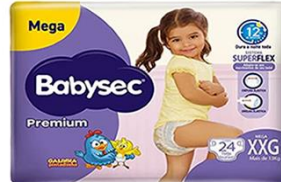
FRALDA BABYSEC PREMIUM MEGA XXG 24UN 8196