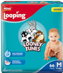
FRALDA LOOPING LT HIPER 66UN M 8408