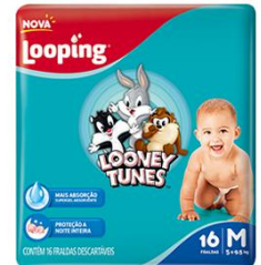
FRALDA LOOPING LT JUMBINHO 16UN M 8412