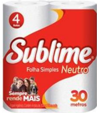
PAPEL HIG SUBLIME FS 30M 04 UN 2439