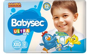
FR BABYSEC ULTRA JUMBINHO XXG 8X12 2407