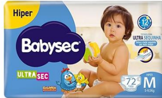
FRALDA BABYSEC ULTRA HIPER M 72UN 8451