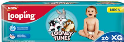
FRALDA LOOPING LT MEGA 26UN XG 8414