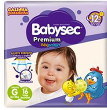
FR BABYSEC PREMIUM JUMBINHO G 16UN 2464