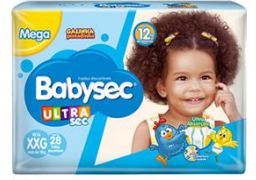
FR BABYSEC ULTRA MEGA XXG 28 UN 2997