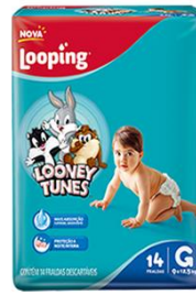
FRALDA LOOPING LT JUMBINHO 14UN G 8411