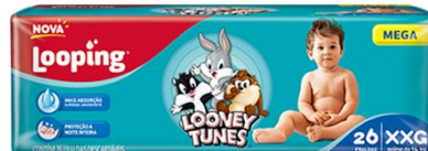
FRALDA LOOPING LT MEGA 26UN XXG 8415