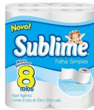
PAPEL HIG SUBLIME FS 30M 08 UN 2440