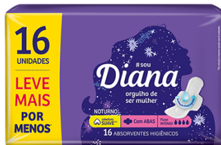
ABS DIANA NOT SUAVE C/ABAS LV16PG14 8404