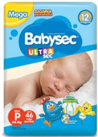
FR BABYSEC ULTRA MEGA P 50 UN 2996