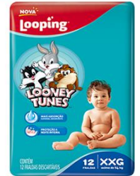
FRALDA LOOPING LT JUMBINHO 12UN XXG 8410