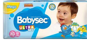
FR BABYSEC ULTRA MEGA XG 36 UN 2450