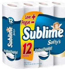
PAPEL HIG SUBLIME FD 30M L12P11 2442