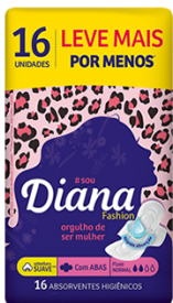
ABS DIANA COB SUAVE C/ABAS LV16PG14 4443