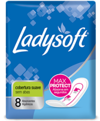
AB LADYSOFT NORMAL SUAVE S/A PCT 8UN 2410