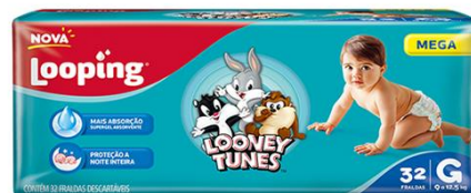
FRALDA LOOPING LT MEGA 32UN G 8416