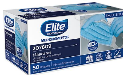
MASCARA CIRURGICA DESC. ELITE 50UN 1226