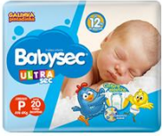
FR BABYSEC ULTRA JUMBINHO P 8X20 2404