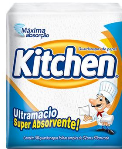
GUARDANAPO KITCHEN FS PQ 50 UN 2998