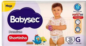
FRALDA BABYSEC SHORTINHO MEGA G 28UN 8159