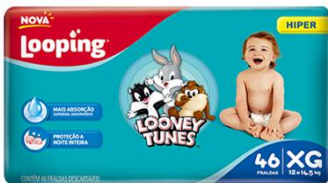
FRALDA LOOPING LT HIPER 46UN XG 8405