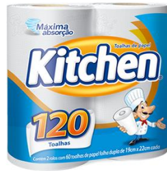
TOALHA PAPEL KITCHEN 02X120UN 2438