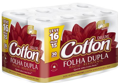
PH COTTON FD 30M NEUTRO L16P15 4494