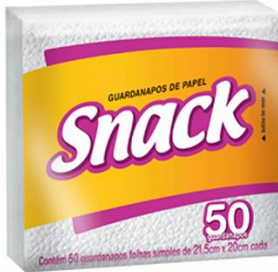
GUARDANAPO SNACK FS PEQUENO PCT 46UN 2431