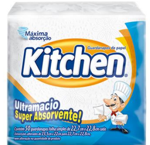
GUARDANAPO KITCHEN FS GD 50 UN 1138