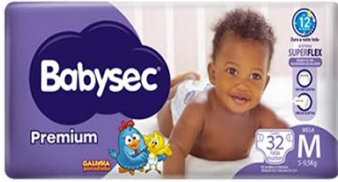
FRALDA BABYSEC PREMIUM MEGA M 32UN 8197