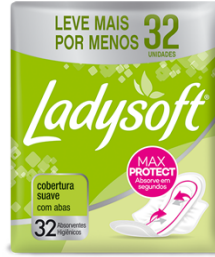
AB LADYSOFT NORMAL SUAVE C/A 32UN 2414