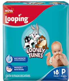
FRALDA LOOPING LT JUMBINHO 18UN P 8413