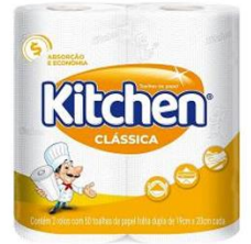
TOALHA DE PAP KITCHEN FD CLASS 100F 2X50 1901