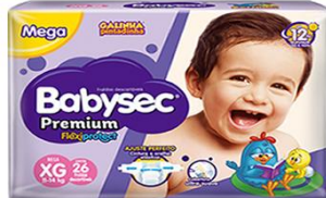
FRALDA BABYSEC PREMIUM MEGA XG 24UN 8195