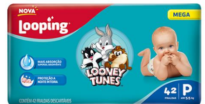
FRALDA LOOPING LT MEGA 42UN P 8418