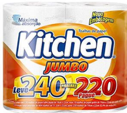
TOALHA DE PAP KITCHEN JUMB FD 240F 2X120 1867