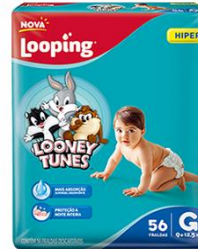
FRALDA LOOPING LT HIPER 56UN G 8407