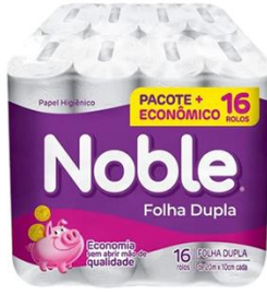
PAPEL HIG NOBLE FD 20M C 16UN 1909