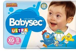
FR BABYSEC ULTRA JUMBINHO XG 8X12 2406