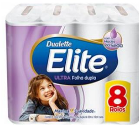
PAPEL HIG ELITE FD 30M 8UN 1172