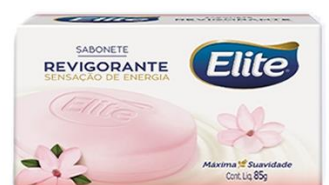
SABONETE BARRA ELITE REVIGOR 85GR 1822