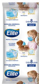
MASCARA CIRURGICA DESC. ELITE 8 UN 1280