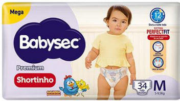
FRALDA BABYSEC SHORTINHO MEGA M 34UN 8158